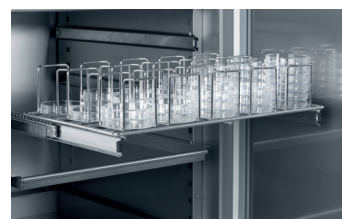
Rack for petri dishes